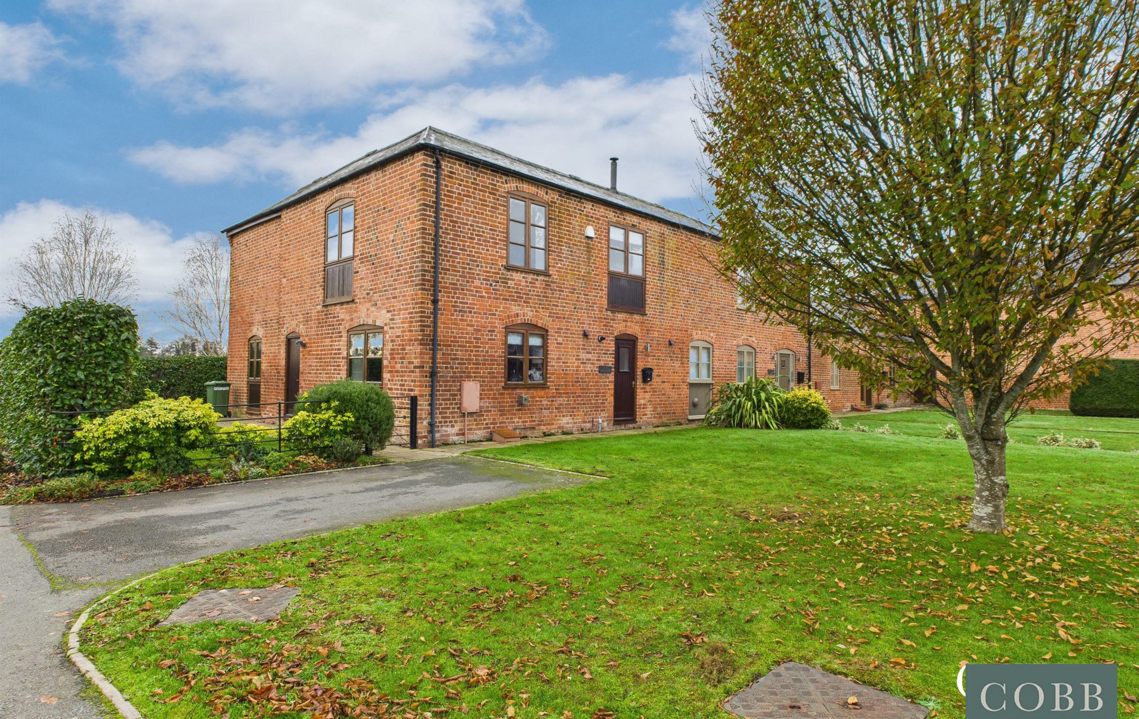
The Granary, West Town Court, Kingsland, HR6 9SS Price £465,000